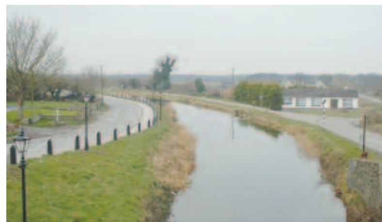
The Grand Canal crosses through Robertstown. Although, the vistas available from Binn's Bridge include the urban fabric of the town, the character of the canal corridor is maintained and the vistas can be described as having scenic value.