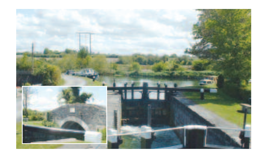
Although urban fabric is visible from the bridge, the vistas onto the Grand Canal are extensive and perceived as having scenic amenity value. The bridge is located at the canal junction. A canal lock is located immediately east of the bridge and a dwelling occurs on the western shores.