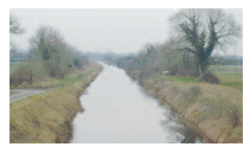
Views onto the Grand Canal from Ummeras Bridge