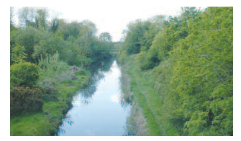
Views of the Grand Canal from Cock Bridge