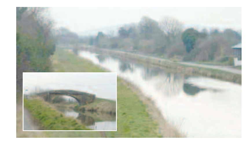
Extensive views towards the Grand Canal are available from Hamiltons Bridge and cover long distances of the water corridor. Although local roads run at both sides of the canal at this point, views remain unaffected.