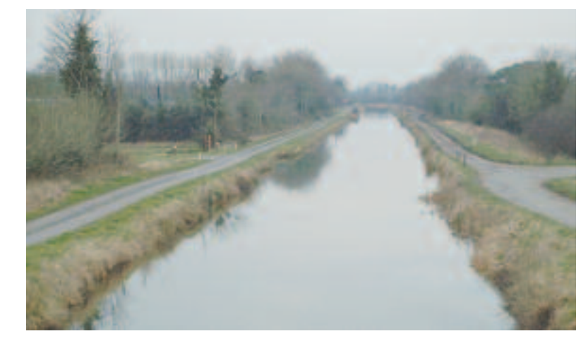
Views of the Grand Canal from Hamiltons Bridge