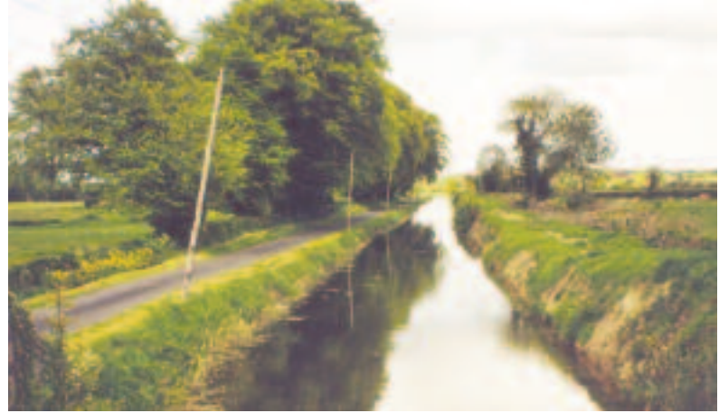
Views onto the Grand Canal from Pluckerstown Bridge