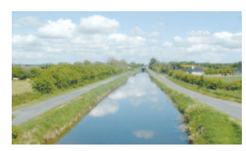
Extensive, long-distance and open views of the Grand Canal and environs are available from Ballyteige Bridge. Scattered housing is also visible on the distance from this viewpoint, which affects the quality of the vistas.