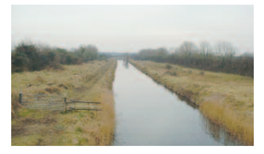
Extensive views of the Grand Canal corridor from Wilsons Bridge