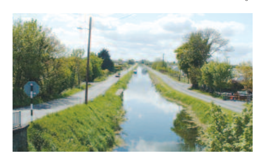
Extensive and long-distance views onto the Grand Canal are provided from Harberton Bridge. Local roads run at both sides of the canal at this point and an existing dwelling disrupts and affects the quality of the views from the bridge.