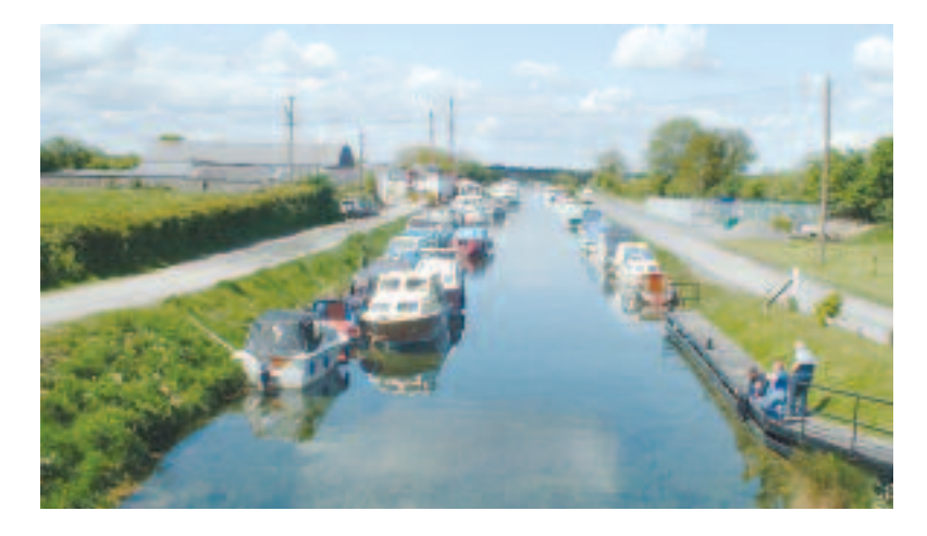
Views of the Grand Canal and dock from Fenton Bridge