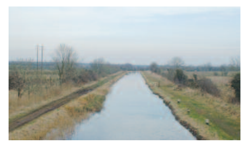
Views towards the Grand Canal from New Bridge cover long and extensive distances. A pedestrian walkway runs at one side of the canal. Canal views have been affected to the north-east by rural development (see photo above: existing farm).