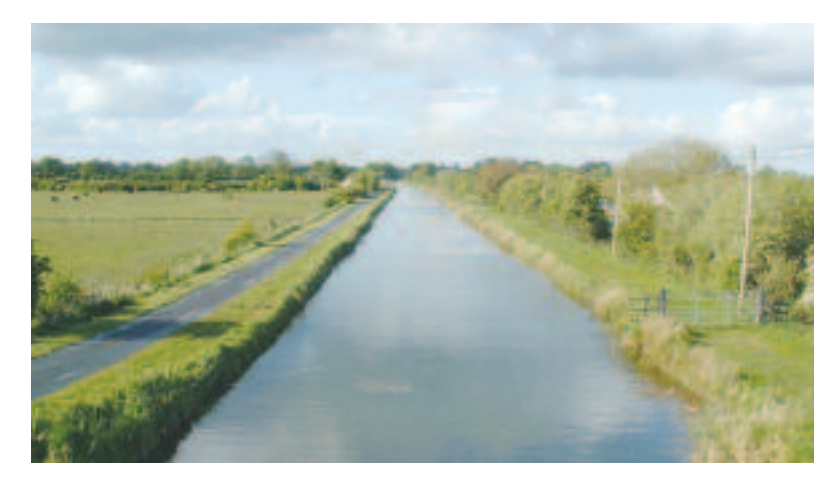
Long distance and open views onto the Grand Canal from High Bridge