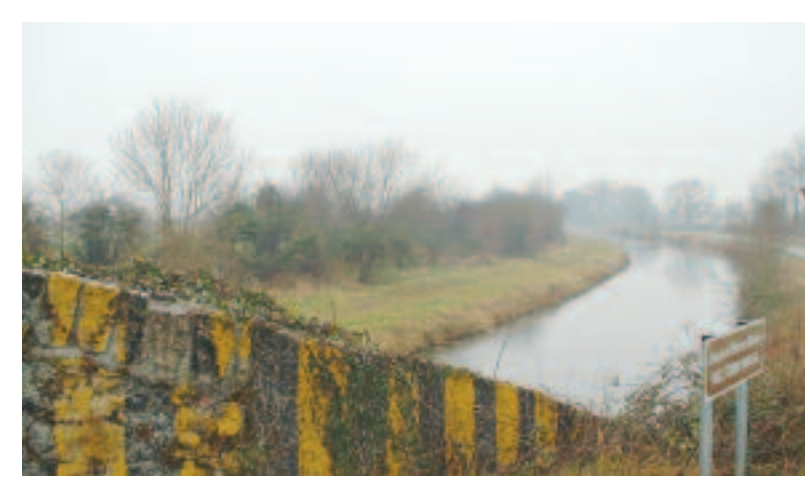
Limited vistas of the Grand Canal are available from this narrow bridge as the canal bends, limiting the extent of visibility of the water corridor. Deciduous trees cover the Canal banks to the west while pastures mantle the eastern lands. The road follows the Canal, providing continuous vistas to this water body.