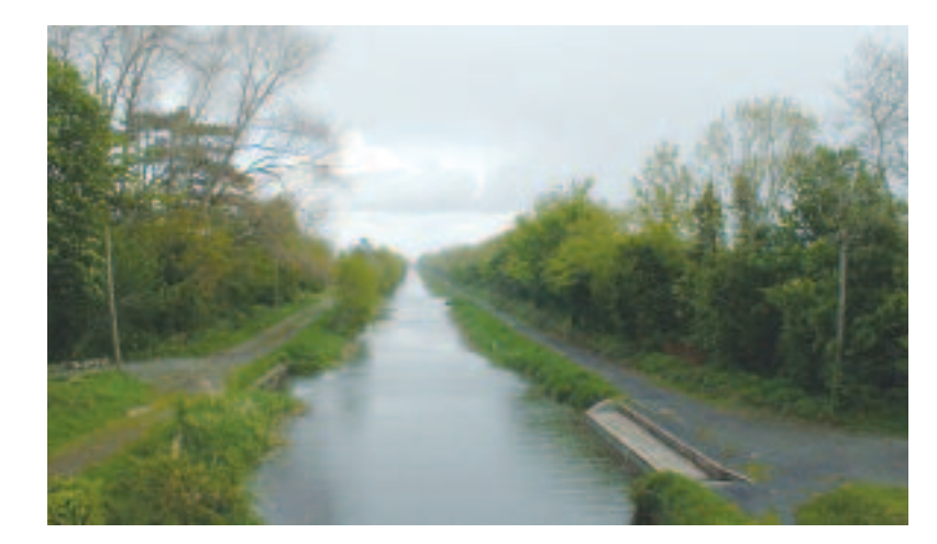
Views to the Grand Canal from Aylmer Bridge