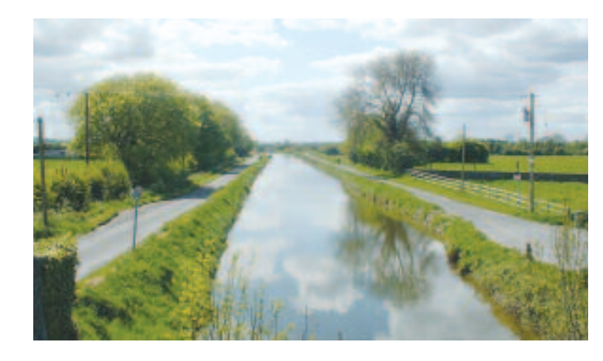
Views of the Grand Canal from Ballyteige Bridge