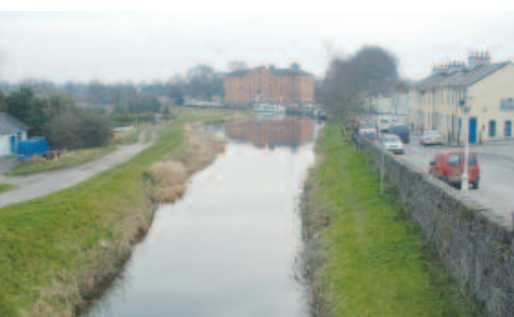
Views to the Grand Canal from Binn's Bridge at Robertstown

GC10 Binn's Bridge - Location: Robertstown