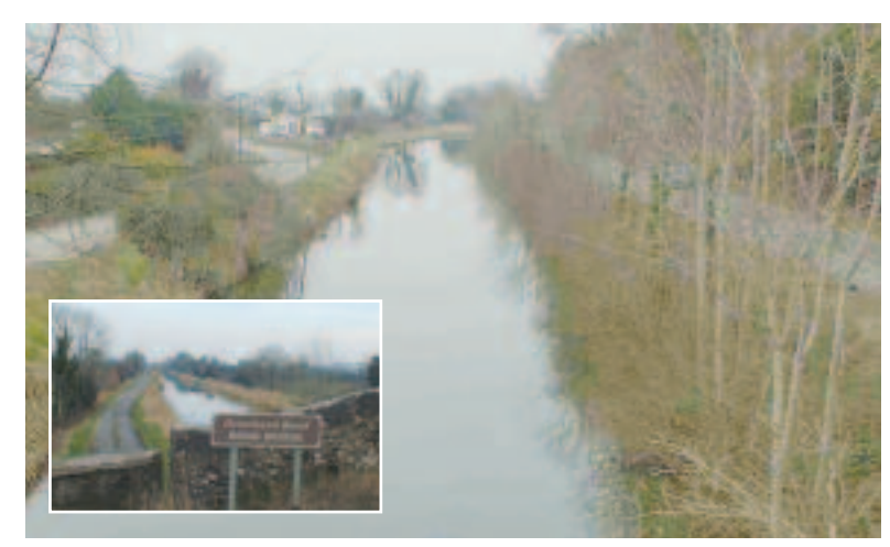
Views towards the Grand Canal from Bond Bridge are extensive and provide long-distance views of the canal corridor. Pasturelands dominate the canal banks, with some scattered vegetation occurring along the shores of the waterway. Although local roads run parallel to the canal at this point, views remain unaffected.