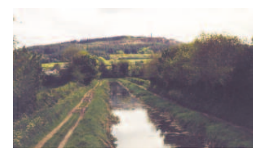
Views of the Grand Canal from Pim Bridge - Note the scenic quality of views onto the Hill of Allen