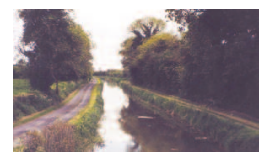
Pluckerstown Bridge allows open and long-distance vistas of the Grand Canal and the rural environs. No development occurs along the shores of the canal at this point; therefore, vistas remain unaffected, rendering Pluckerstown Bridge as a high amenity value viewpoint.