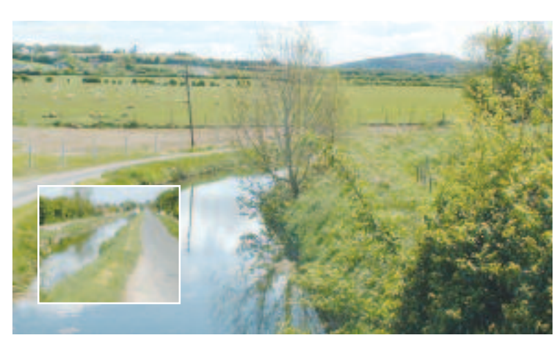
Huband Bridge is a triple junction bridge, sitting on the Grand Canal junction south-west of Robertstown. The bridge allows open and extensive vistas onto the canal and the surrounding rural countryside. Views of Ballyteige and Pim Bridges are available to the west, whilst the Hill of Allen defined the skyline to the south. Although a limited number of dwellings are located in the vicinity, views remain unaffected.