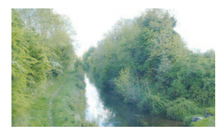
The scenic quality of the vistas that are available from Cock Bridge remain unaffected, as development has not taken place along the shores of the canal at this point. Although long-distance views of the canal are available, existing vegetation screens views to the surrounding rural areas.