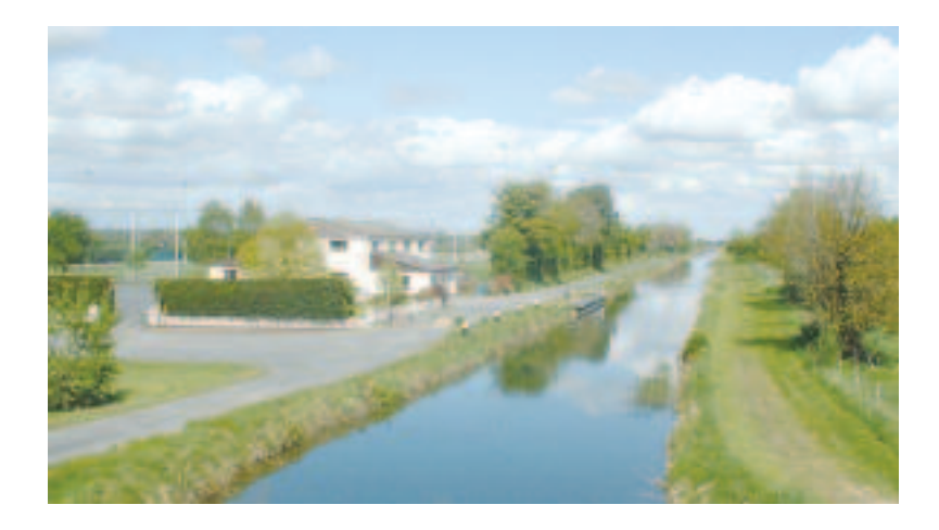
Views of the Grand Canal from Skew Bridge