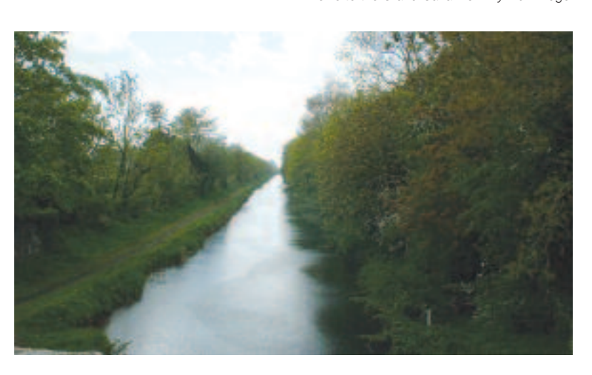
Aylmer Bridge provides long-distance views of the canal. The vegetation growing along the canal embankment encloses vistas on this landscape feature, limiting the available views to the surrounding rural countryside.