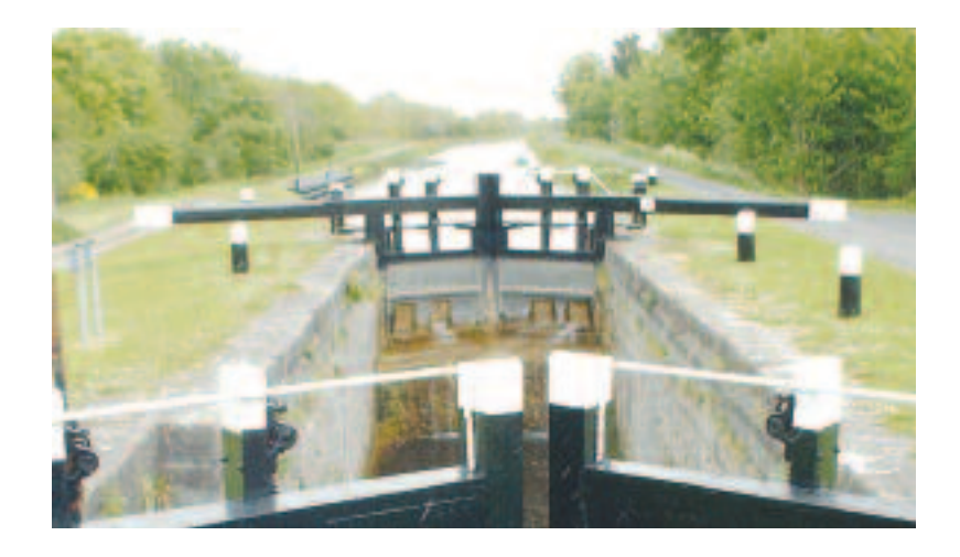
Glenaree Bridge provides open views of the Grand Canal to the south and long-distance vistas of the waterway to the north, the canal lock framing the corridor. Although an old farm is located in the vicinity of the bridge, views remain unaffected.