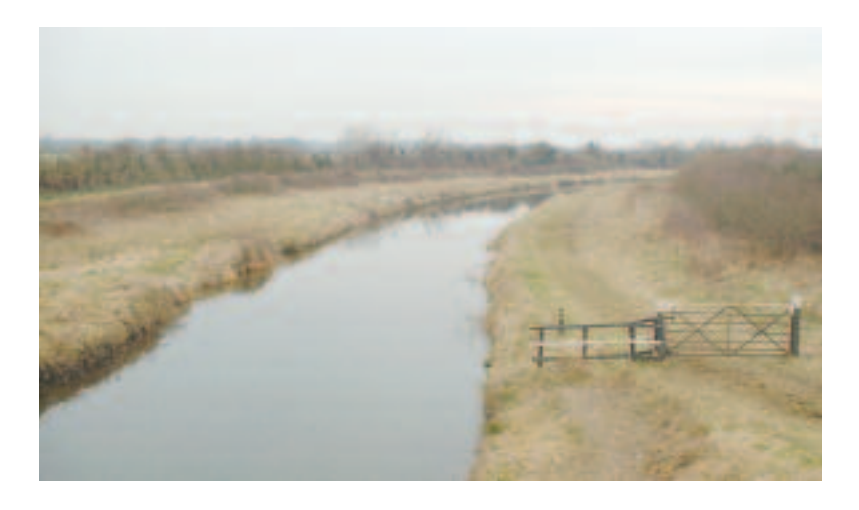
Extensive, long-distance and open views to the Grand Canal are available from Wilsons Bridge. Grassland dominates the canal banks whilst occurring scattered shrubs and deciduous trees add complexity to the vista.