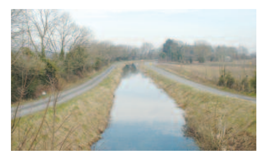
Views to the Grand Canal from Harberton Bridge