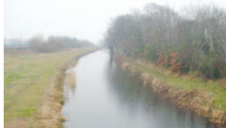
Views to the Canal from Milltown Bridge