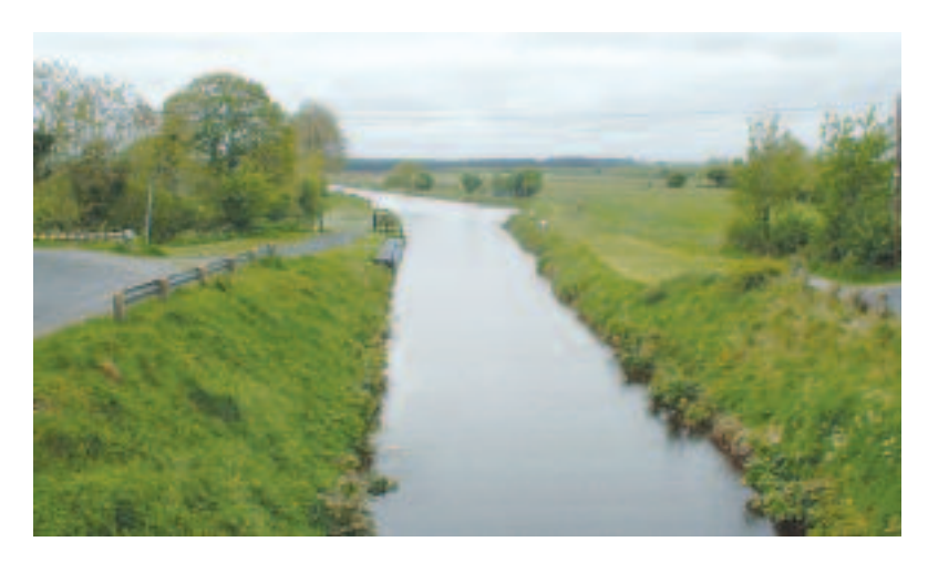
Views onto the Canal, and lock to the north, from Glenaree Bridge