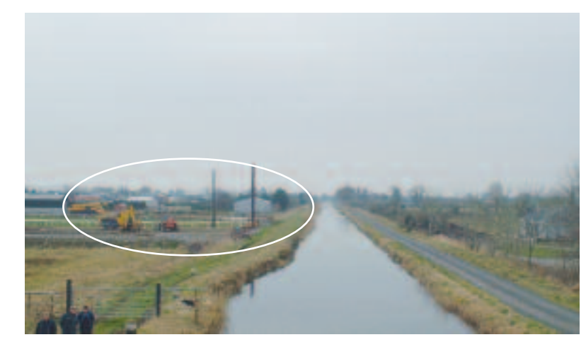
Views to the Grand Canal from New Bridge