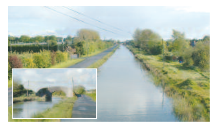
High Bridge provides open and long-distance views of the Grand Canal. Although scattered development occurs in the vicinity, these are screened by existing vegetation and therefore, views remain unaffected. Extensive views of the rural environs west of Monasterevin are also available from the bridge.