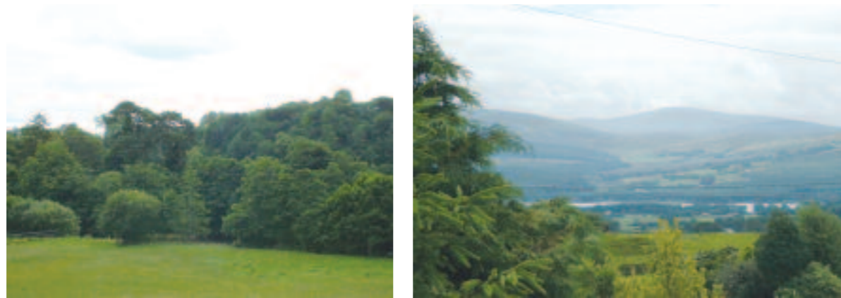
Views of the River Liffey Valley screened by existing vegetation (see left above) and views to Poulaphuca and the Wicklow Mountains along the local roads at Ballymore Eustace

The R411 also allows scenic vistas to the Wicklow Mountains when looking to the east. The mountains determine the extent of visibility as well as defining the skyline. The land gently slopes towards adjacent hills dominated by pasturelands with low hedgerows and scattered trees. The road continues east of Ballymore and long distance views of the Poulaphuca Lake and the Wicklow Mountains can be obtained at certain points.