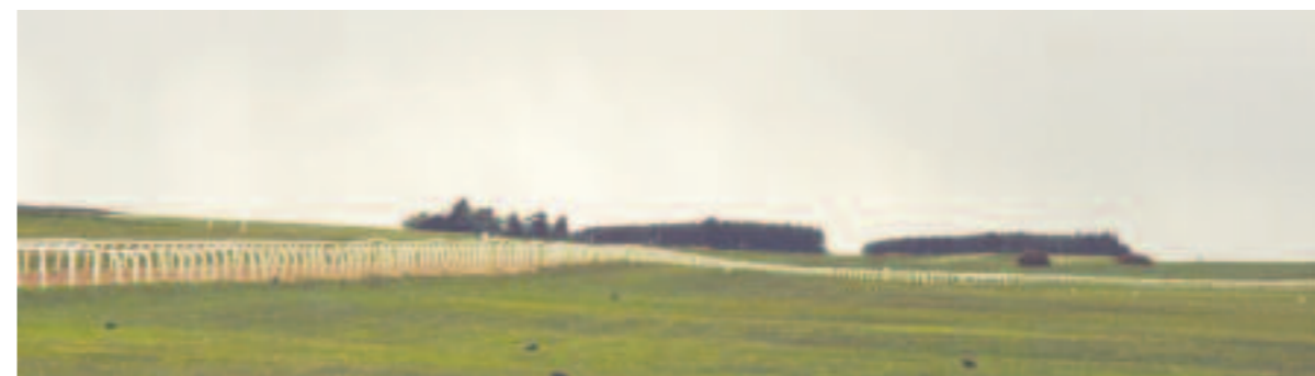
Views to the Curragh from the north and south

Local roads south of the Curragh allow vistas onto the racecourse lands as well as the military camp and ranges. The land softly undulates throughout and gently rises on the eastern section of the road, limiting the extent of the views. Scrub vegetation (i.e. gorse) and conifer forests add complexity to the otherwise smooth terrain.