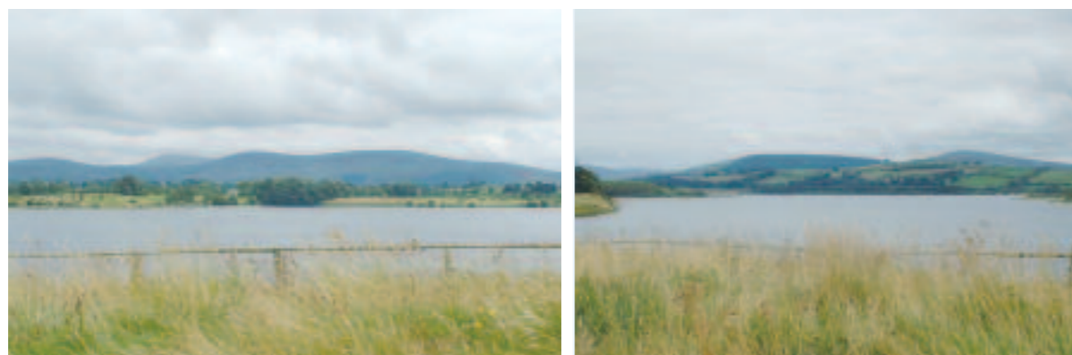
Views of Blessington Lake - from the N81 near Glassing (above) and from Poulaphuca Bridge (below)

The gently undulating topography of the area and the significance of the water feature at Poulaphuca Bridge provide high scenic and amenity value to this viewpoint.