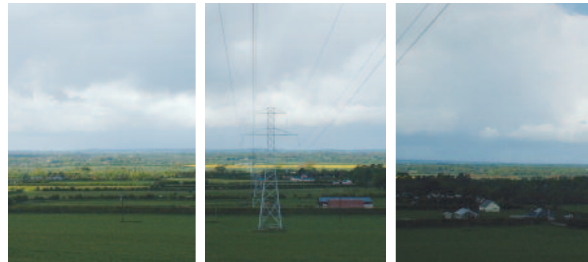
Extensive views from Oughterard local roads

Extensive vistas of the Kildare plains are available from L2009 local road that runs through Oughterard. The elevated nature of the lands in the area allows open and long-distance vistas of the lowlands to the west. An existing powerline significantly, however locally, affects the quality of the views (see photo below). Nevertheless, and despite the scattered housing that occurs throughout the plains, the extensive character of the views provides highly scenic vistas.