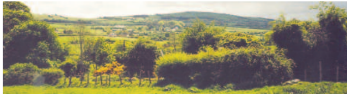
Views from the N78 looking onto Old Kilcullen Hill and environs

Extensive and open views of the undulating lands are available from the N78, when looking north towards Old Kilcullen village. The commonly smooth terrain of the area allows for long-distance vistas of this part of the County, whilst the existing topography and vegetation (e.g. hedgerows and scattered trees) add complexity to the views and partially screen the highly scenic vistas. Nevertheless both the hill south of Old Kilcullen and the Wicklow Mountains in the distance to the east remain always visible, defining the skyline when viewed from any section along the designated road. Although scattered housing is located along the local roads, vistas remain generally unaffected.