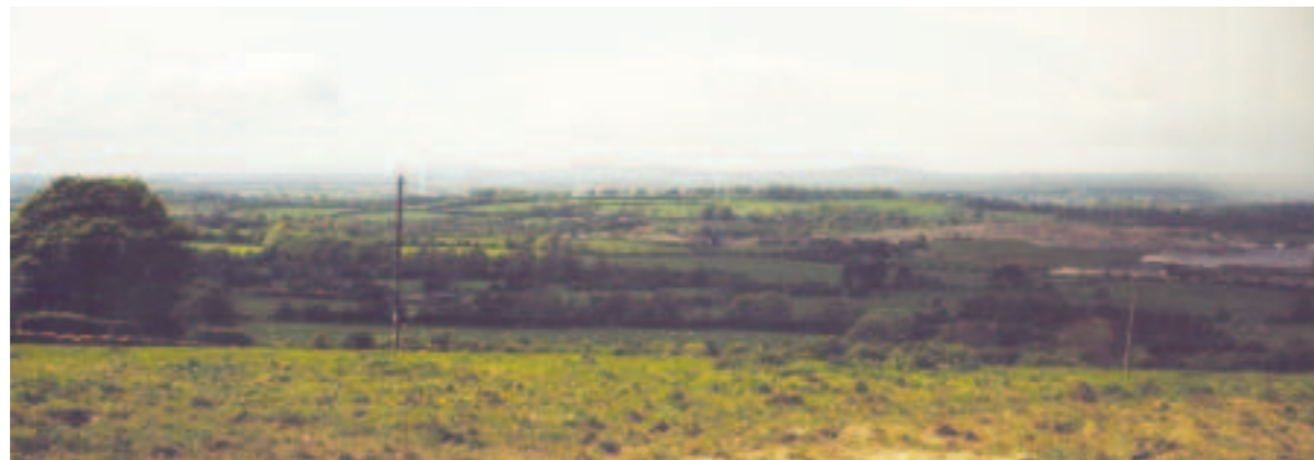
Open views of the surrounding undulating lands and the Wicklow Mountains which define the skyline in the distance

The L6018 local road that runs through Oughterard provides scenic vistas of the undulating lands at the County Boundary, as well as views of the Wicklow Mountains in the distance. The elevated nature of the road and the existing low vegetation of the agricultural lands allow long-distance visibility. The generally smooth terrain is interrupted by hedgerows and conifer forests. Although scattered housing occurs throughout the area, these are partially screened by existing vegetation. Thus, the vistas available from the road remain generally unaffected.