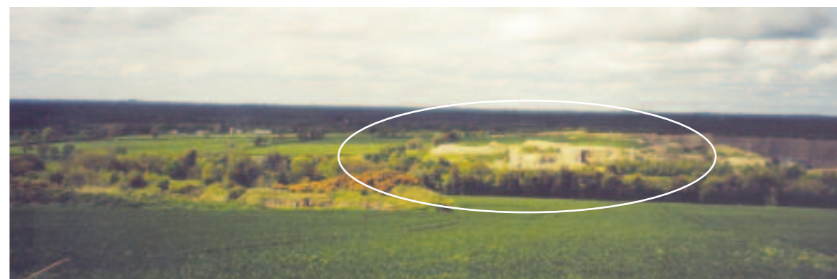
Extensive and long-distance views from a local road on the western slopes of Boston hill - Note the visual prominence of the existing quarry

Although the scenic quality of the views can be classified as high, an existing quarry affects certain sections of the designated scenic road (see photo below). Nevertheless, due to the extensive nature of the views and the generally rural character of the area, the visual amenity obtained from this drive remains generally unaffected.