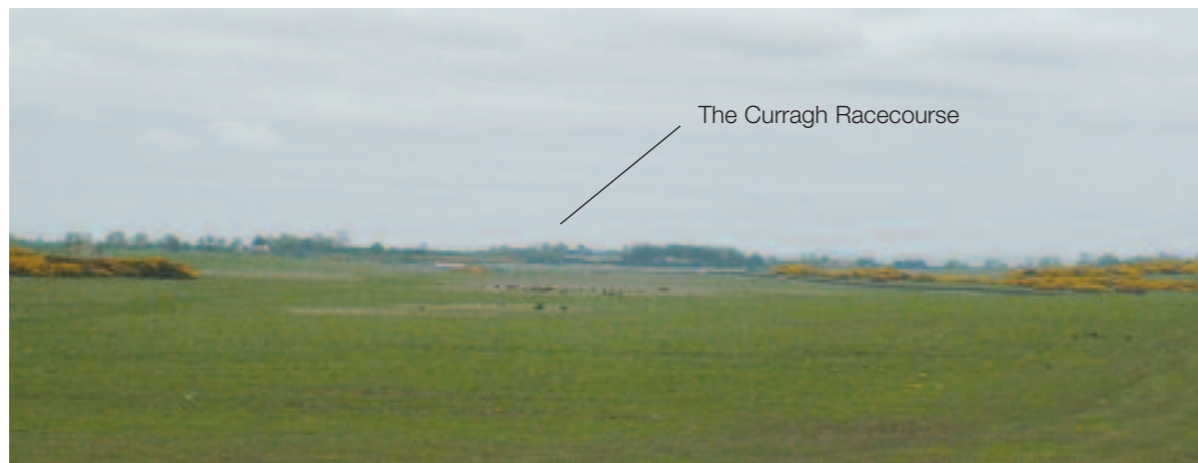
Views to the Curragh from the N7

Extensive and open views are available from the N7 national road that runs through the Curragh racecourse, east of Kildare town. The generally smooth terrain and the lack of hedgerows allow for long-distance vistas, the extent of which however is restricted by the softly undulating topography. Existing conifer tree plantations add complexity to the otherwise smooth terrain and plain vistas.