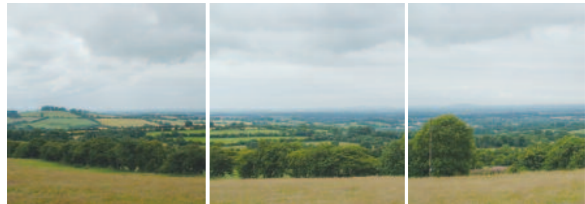
Views to the south west (above) and south east (below) from Rathmore local road

The local road that runs through Rathmore provides scenic vistas of the Kildare plains to the southwest and the undulating lands at the County Boundary to the southeast. The elevated nature of the road and the generally low hedgerows and vegetation of the agricultural lands allow long-distance visibility. Although scattered rural housing is located in the area, these are partially screened by existing vegetation. The views available from hedge opening along the road remain unaffected.