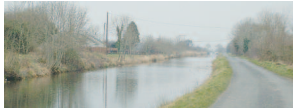
Views across the Canal and the surrounding countryside near Robertstown

The local road running parallel to the Grand Canal when approaching Robertstown, allows scenic views onto the surrounding countryside. The rural character of the landscape and the existing bog remnant in the outskirts of the town provide visual amenity and remain unaffected by the development that exists in the vicinity. The local roads also allow open and extensive vistas of the surrounding countryside. These local roads are signposted as Kildare tourist routes.