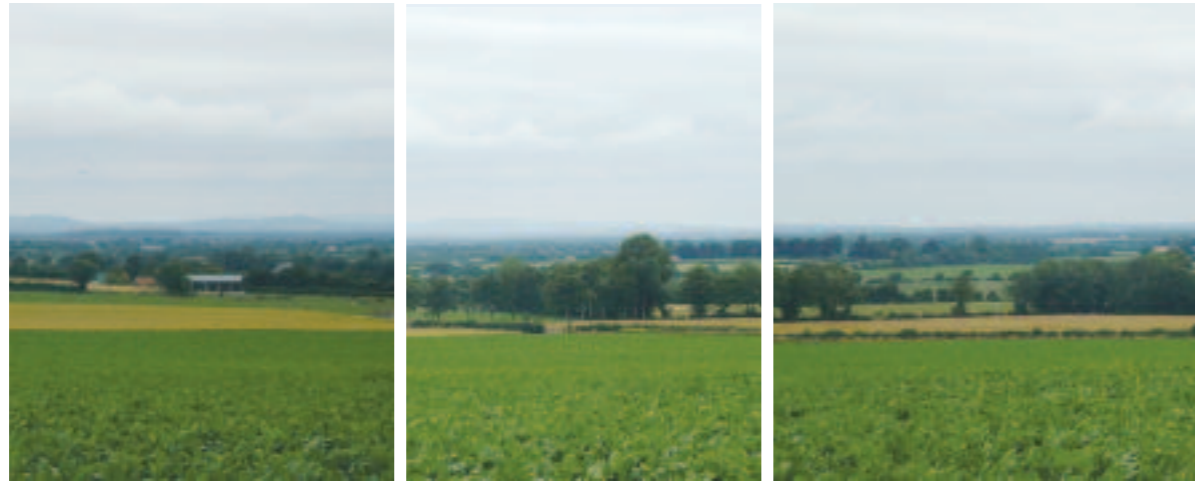
Long distance views to the west from the N78 (near Athy)

Long distance views towards Moate and Ardscull are available from the N78 national road (north of Athy). The flat topography of the area and the apparent elevation of the N78, allow for extensive and long-distance visibility of the surrounding environs. The existing vegetation throughout the agricultural lands and the hilltops that define the skyline to the west, add complexity to the high scenic quality of the available views.