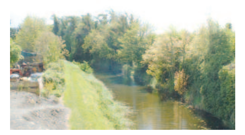
Views onto the Royal Canal from Allen Bridge