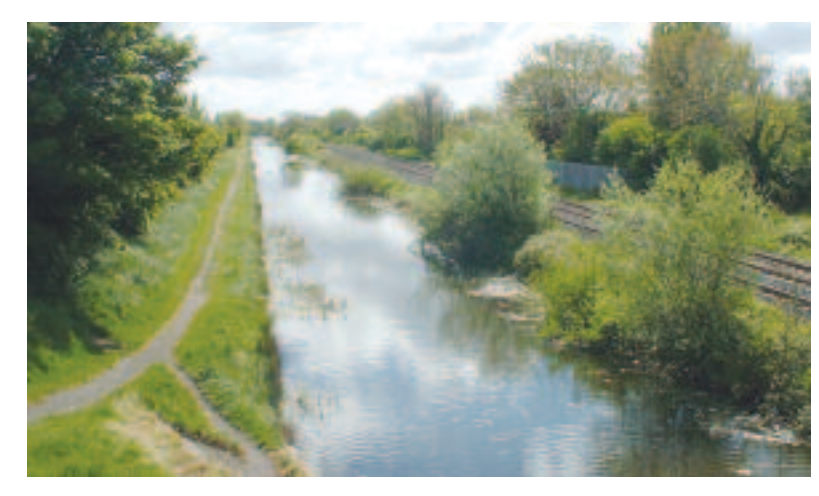
Views to the Royal Canal from Cope Bridge

RC2 Cope Bridge - Location: Newtown / Leixlip