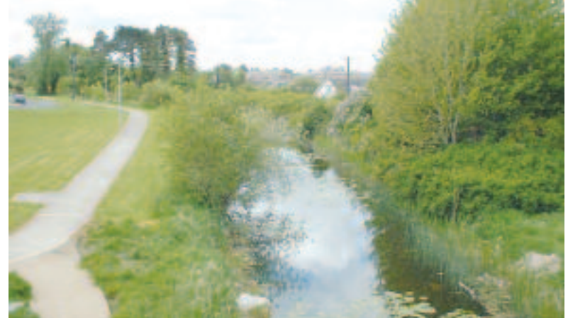
Views onto the Grand Canal from Plonpluck Bridge