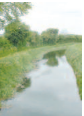
The old Milltown Bridge provides highly scenic vistas onto the canal and the Hill of Allen to the north. Southern vistas are affected by the existing dwellings: the historic views of the remains of an old building highly contrast with the new development (see photo above).