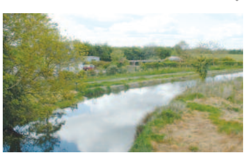
Views to the north from Limerick Bridge remain unaffected as development in the vicinity is screened by existing vegetation. However, a dwelling is visible to the south affecting the quality of the available vistas.