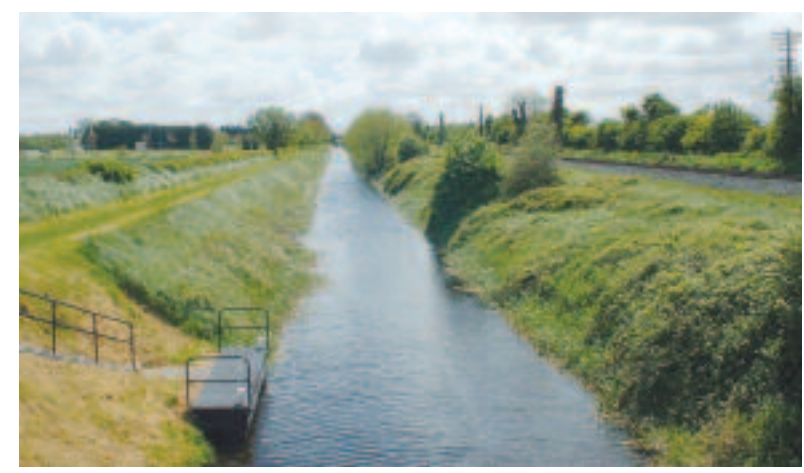
Views onto the Royal Canal from Chambers Bridge