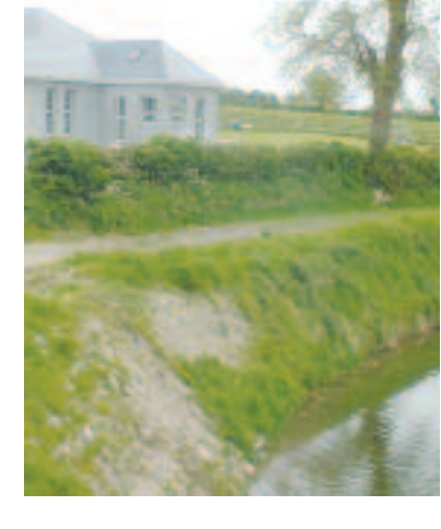
Views at Miltown Bridge provide vistas onto the Grand Canal, Hill of Allen and nearby environs