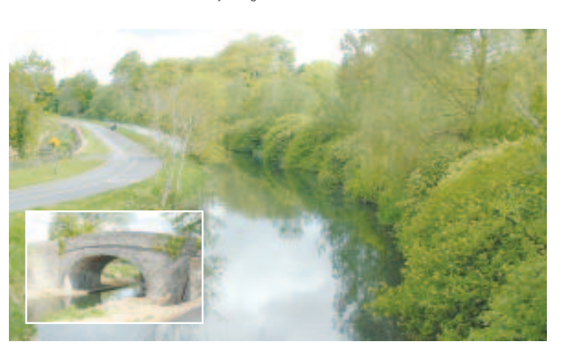
Tandy Bridge is located in Naas town, and despite its urban location and the road running parallel to the canal at this point, the scenic quality of the vistas available from the bridge remain unaffected.