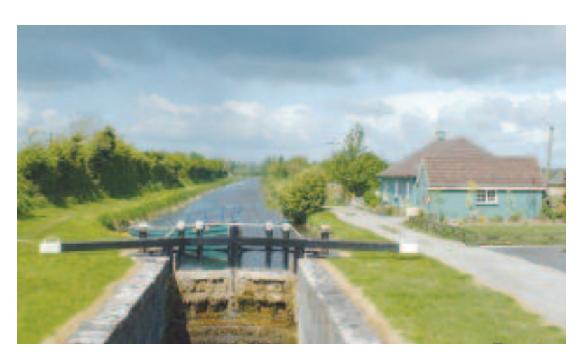
Open and long-distance views are available from Chambers Bridge. Views to the west look onto the canal lock and an existing dwelling, which affects the quality of the views. Views to the east provide extensive vistas of the canal and environs. These remain unaffected although a railway line runs parallel to the canal, and is therefore visible from this viewpoint and a sports complex can also be seen on the shores of the canal.