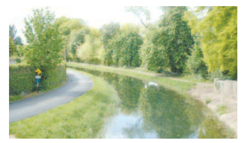
Tandy Bridge in Naas and available views onto the Grand Canal