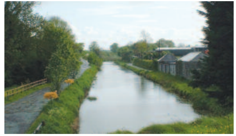
Views of the Grand Canal from Clogheen Bridge