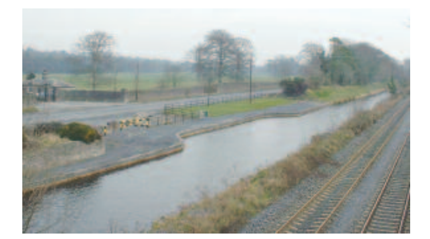
Views from Pike Bridge onto the Royal Canal