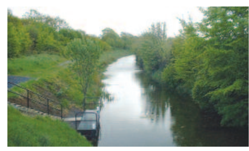
Views from Deey Bridge