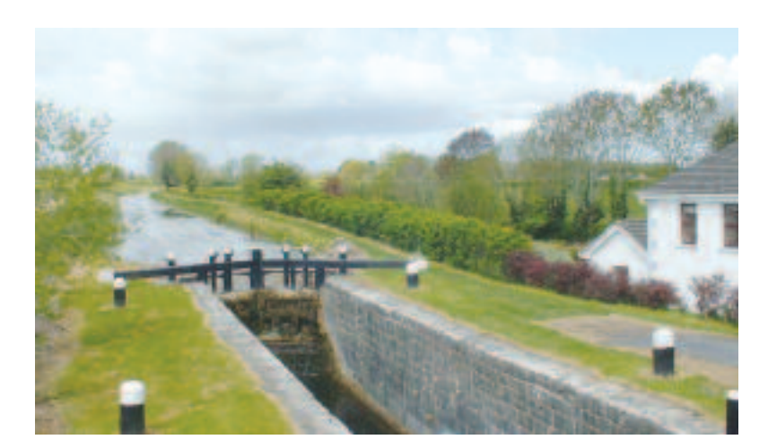
Long-distance views of the Royal Canal are available from Jacksons Bridge. Existing vegetation along the canal banks screens surrounding agricultural lands and limits the extent of the views. A dwelling is located immediately to the west of the bridge, parallel to the canal lock, affecting the scenic value of the vistas. The quality of the available long-distance views however remains unaffected.