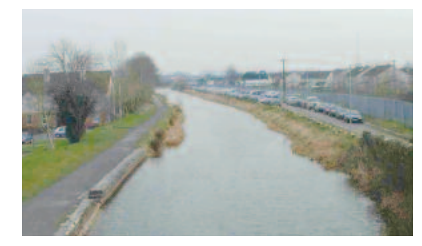
Views onto the Royal Canal from Bond Bridge