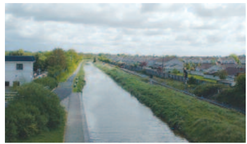
Views onto the Royal Canal from Mullen Bridge