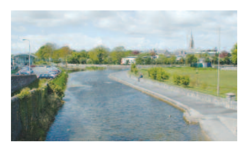
Mullen Bridge is located on the urban environment of Maynooth town and the railway line runs parallel to the canal at this point. As a result of its location, views from the bridge onto the canal are affected by elements of the urban fabric. Nevertheless, the viewpoint allows extensive and long-distance vistas of the canal corridor.

Vistas from Pike Bridge include long-distance views of the Royal Canal to the east and west, the scenic landscape of the Carton Demesne to the north and the rural countryside to the south, which is considered to have significant scenic value due to existing deciduous trees and to its open character. Despite both a road and a railway running parallel to the canal at this point, views onto the canal and its environs remain scenic. The surrounding landscapes add amenity and quality to the views available from this viewpoint.