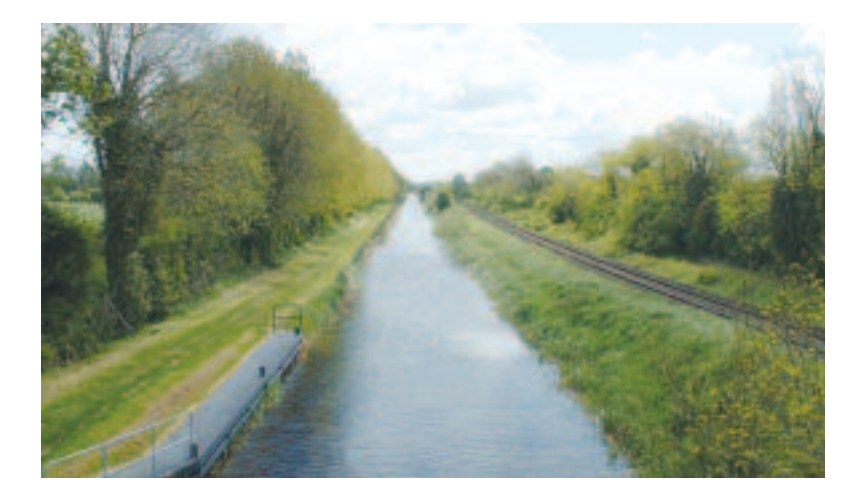
Views onto the Royal Canal from Jacksons Bridge