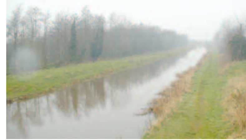
River Barrow views from Bunberry Bridge