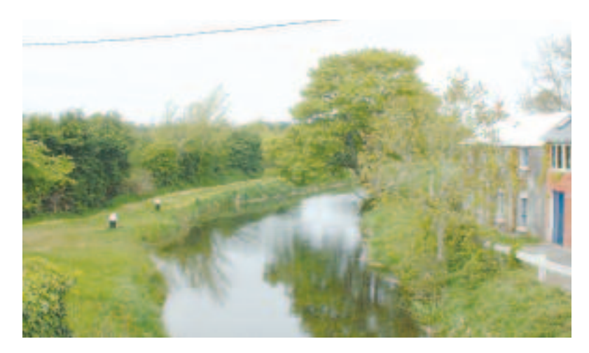
Views onto the Grand Canal from Miltown Bridge