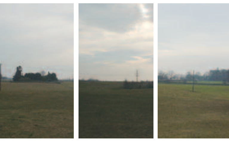
Views from Pike Bridge to the countryside

Vistas from Pike Bridge include long-distance views of the Royal Canal to the east and west, the scenic landscape of the Carton Demesne to the north and the rural countryside to the south, which is considered to have significant scenic value due to existing deciduous trees and to its open character. Despite both a road and a railway running parallel to the canal at this point, views onto the canal and its environs remain scenic. The surrounding landscapes add amenity and quality to the views available from this viewpoint.