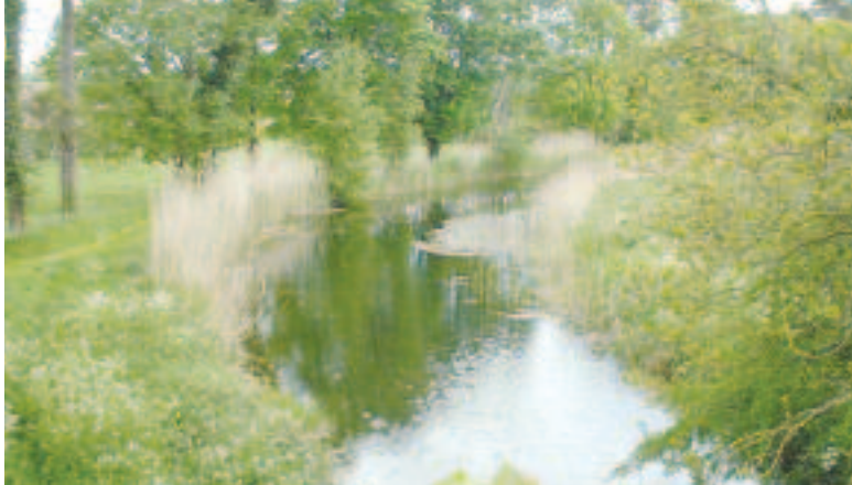
Views onto the Grand Canal from Limerick Bridge