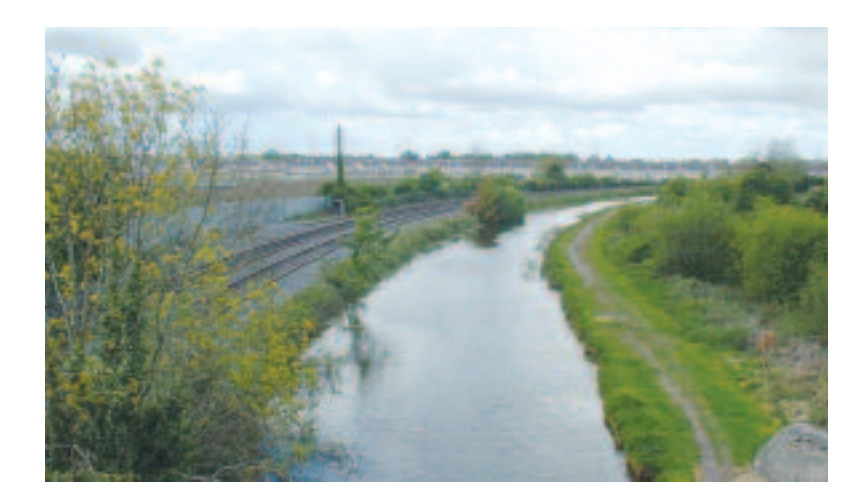
Views of the Canal and its environs from Louisa Bridge

RC3 Louisa Bridge - Location: Easton / Leixlip