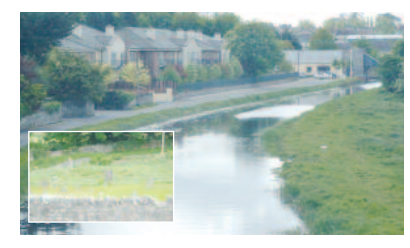
Views onto the Canal from Abbey Bridge