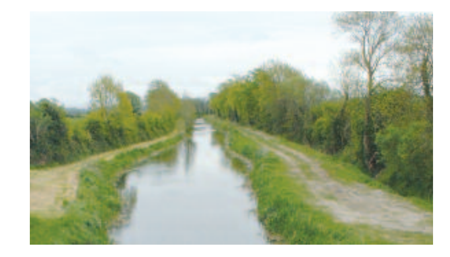
Despite its central location in Miltown village and its urban setting, Miltown Bridge allows for long-distance and unaffected vistas of the Grand Canal to the south. Dwellings and elements of urban fabric are visible to the north.