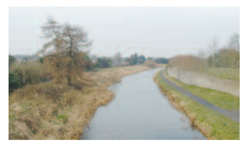
Despite the urban location of Bond Bridge, views to the west remain unaffected as the urban fabric is screened by existing vegetation and the landscape character of the canal corridor is maintained. However, views from the bridge to the east are affected as they look onto the urban fabric of Maynooth environs.