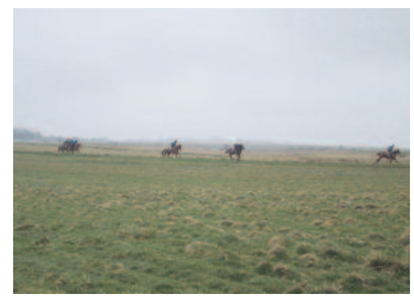
Agriculture in County Kildare

County Kildare is renowned for its breeding of thoroughbred horses. It has a high percentage of thoroughbred horses with the largest concentration around the Curragh. Other patterns of agricultural activity in the County include a rich mix of tillage activity, and livestock production.