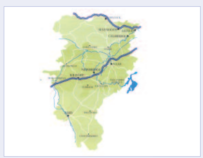
Map 1.1 Towns, Rivers, Canals, Boglands, Plainlands and Uplands of County Kildare