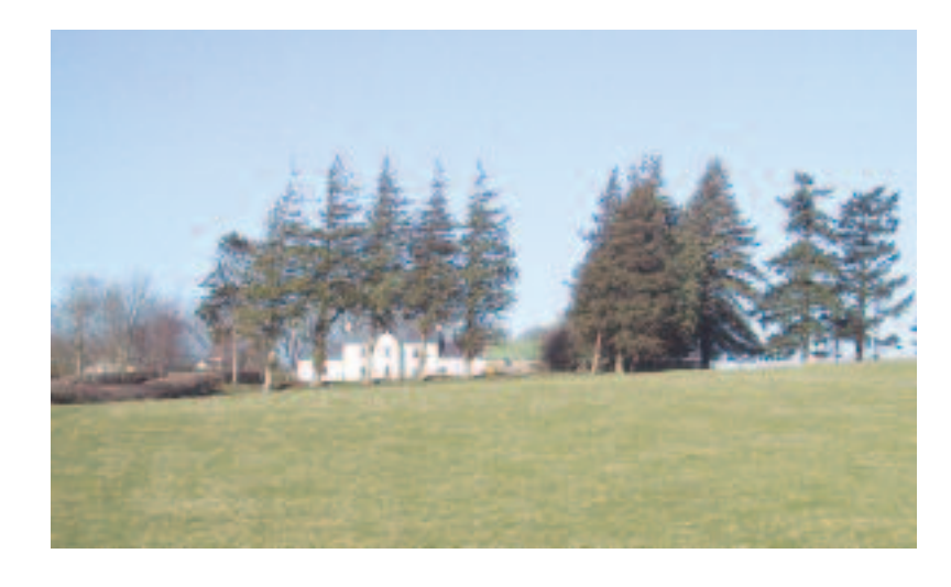
A stunning view over County Kildare, but very obtrusive location for a house on a ridge in the landscape, Kilteel

Visible but well contained in the upland landscape, near Ballymore Eustace