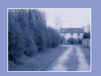
Chapter 22 Kildare Rural Design and Development Guidelines