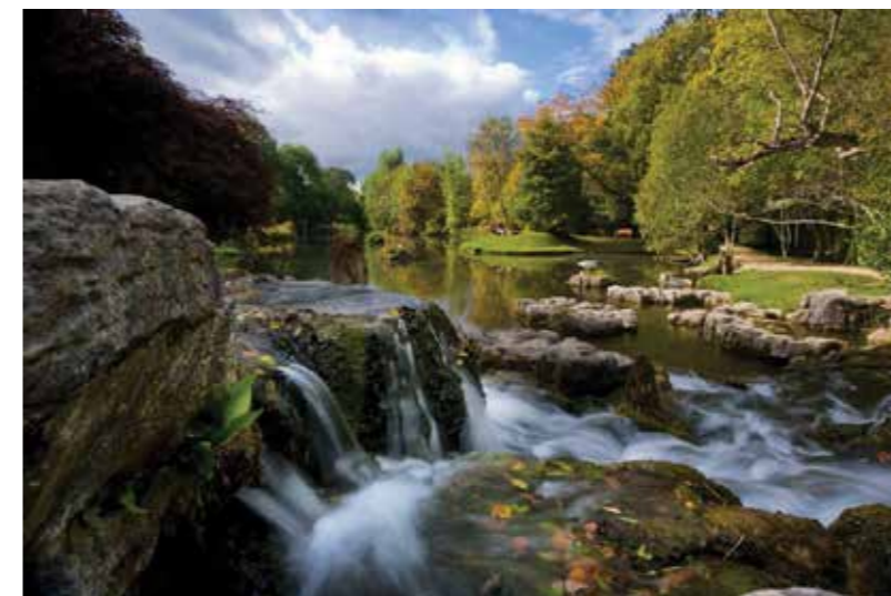
Table 13.2: Natural Heritage Areas in Co. Kildare

There are 23 designated or proposed Natural Heritage Areas (NHAs), within the county (Table 13.2 and Map 13.2 Refer).