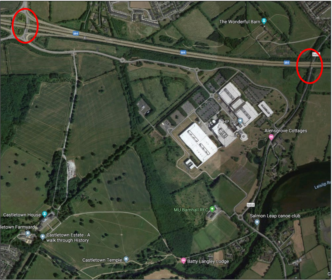
Figure 2.3: Aerial view of the HP Site with the existing bridges over the M$ identified in red.

We note that there are two existing bridges that cross over the M4, one to the north west of the Liffey Business Campus, which currently provides pedestrian and segregated cycling infrastructure and one to the north east with pedestrian infrastructure. (See Figures 2.3; 2.4 and 2.5 below.)