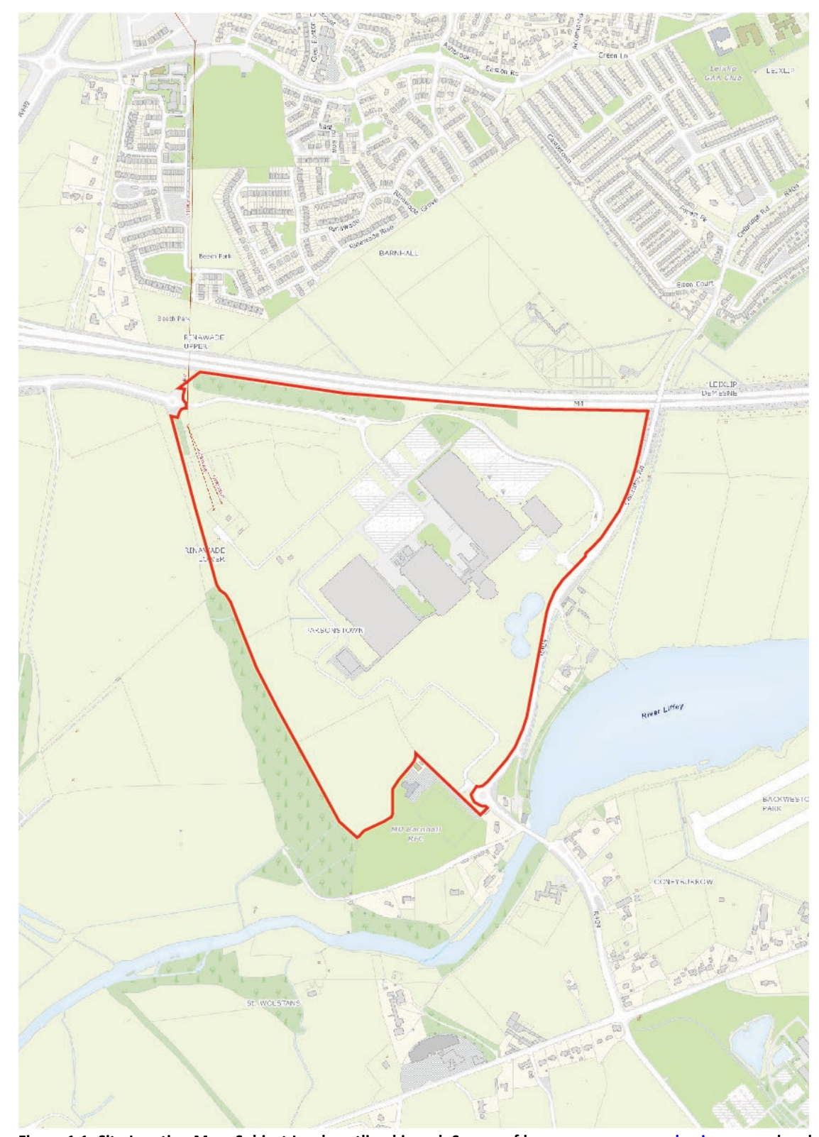
Figure 1.1: Site Location Map. Subject Lands outlined in red.