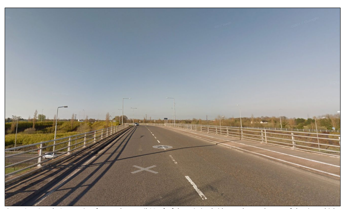
Figure 2.4: Google Street View (Image date April 2017) of the existing bridge to the north west of the site, which currently provides pedestrian and segregated cycling infrastructure.