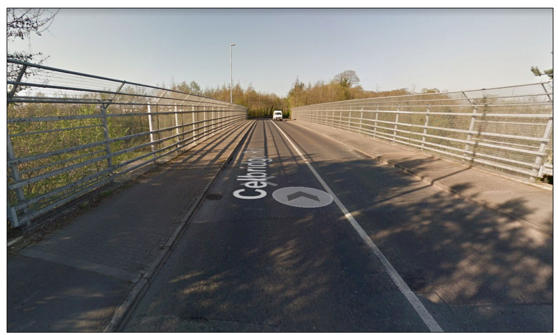
Figure 2.5: Google Street View (Image date April 2017) of the existing bridge to the north east of the site, which currently provides pedestrian and infrastructure.

In our opinion the existing infrastructure is sufficient to ensure a good accessibility between lands to the north and to the south of the M4. We believe that upgrading the existing infrastructure of the bridge located to the north east of the Liffey Business Campus to provide a segregated cycle lane would be a more efficient use of resources.