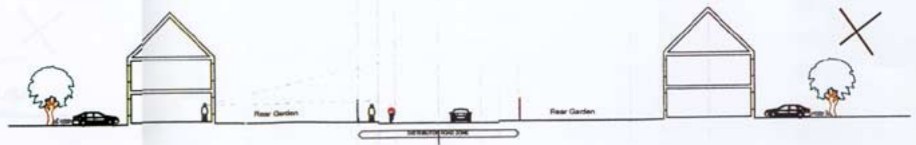
Fig. 4.6 A preferred layout for Suburban Distributor Roads

Houses back onto the road. Passive supervision of the road from neighbouring properties is poor and the environment for pedestrians and cyclists is hostile.