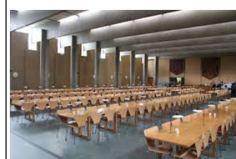
Project: St Catherine's College, Oxford UK Architect: Arne Jacobsen