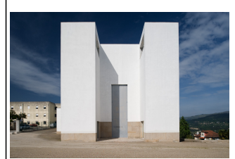
Project: Church of Marco de Canavezes Architect: Alvaro Siza