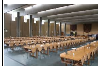
Project: St Catherine's College, Oxford UK Architect: Arne Jacobsen