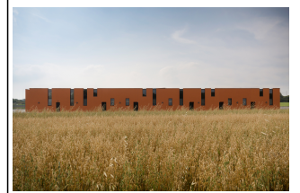
Project: Meath GAA Centre of Excellence Architect: Cooney Architects Reference Images from http://www.cooneyarchitects.com/portfolio/dunganny-gaa-meath/