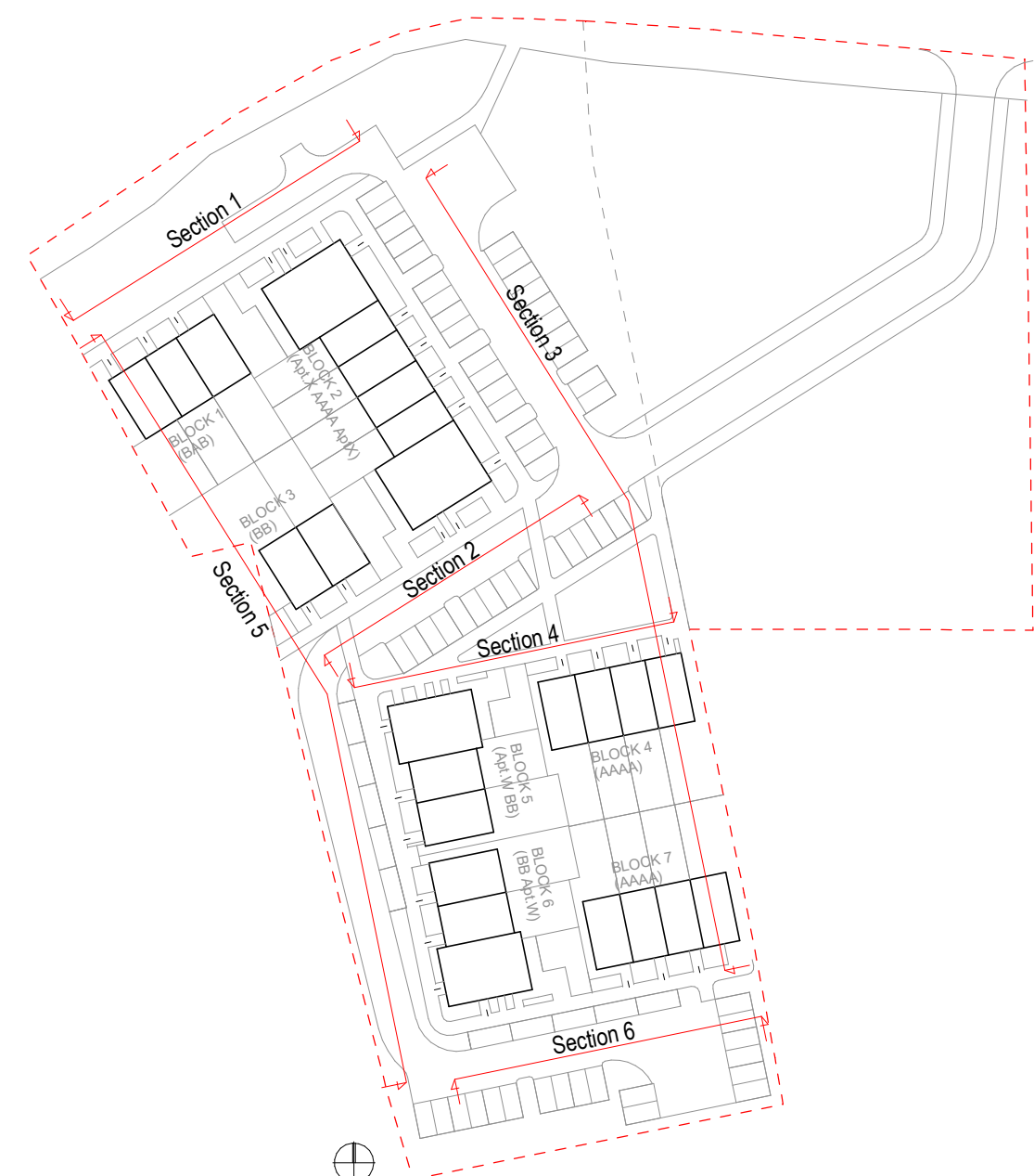
Key Plan 1 : 1000