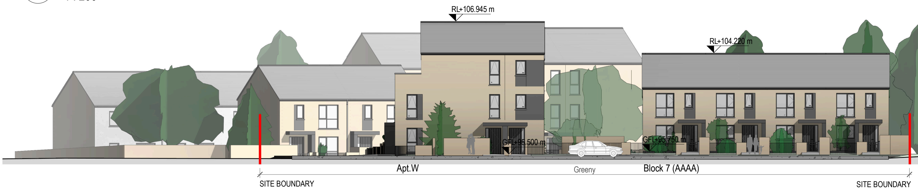
6 Street Elevation 6 1 : 200