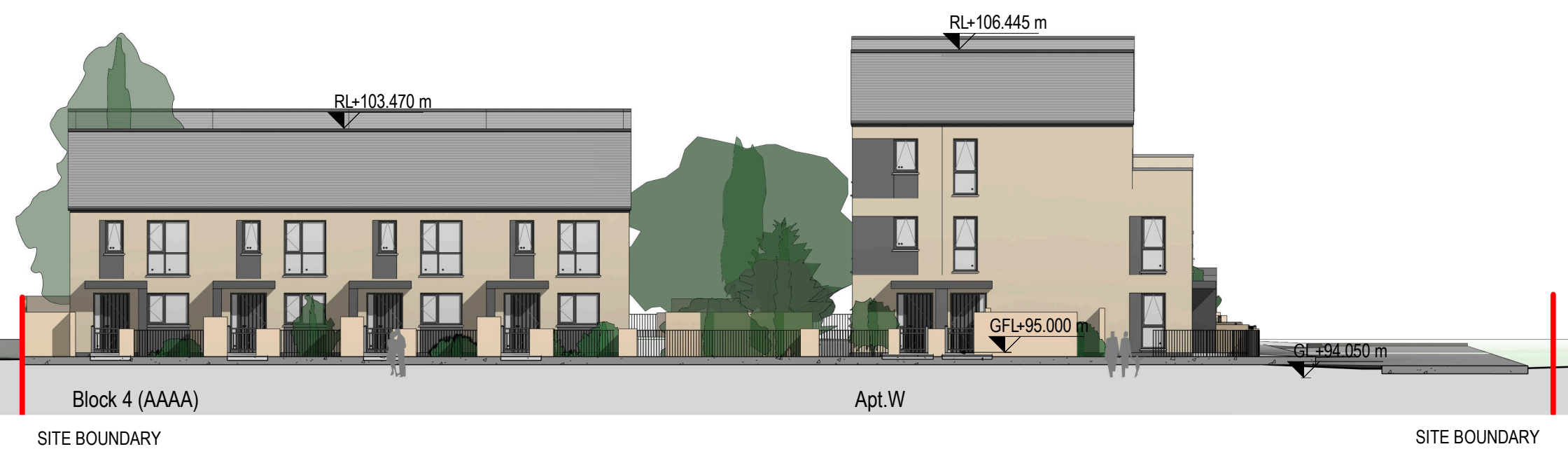
4 Street Elevation 4 1 : 200