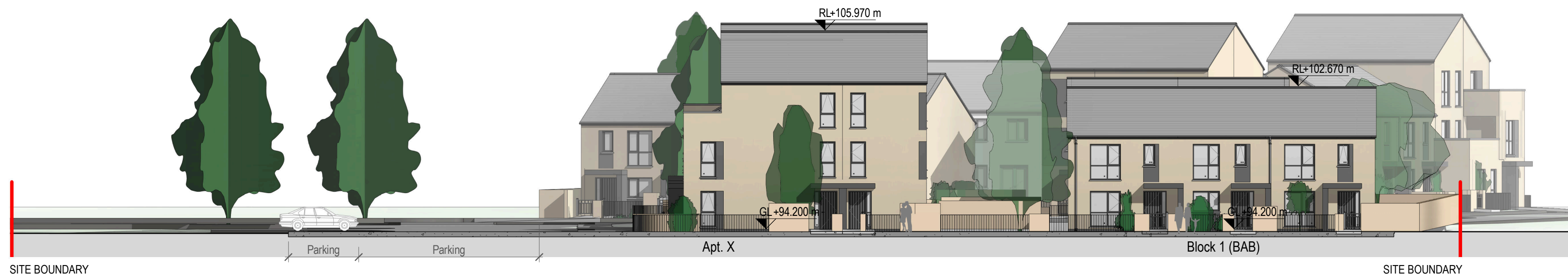
1 Street Elevation 1 1 : 200