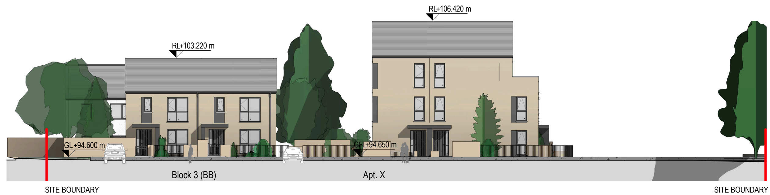
2 Street Elevation 2 1 : 200