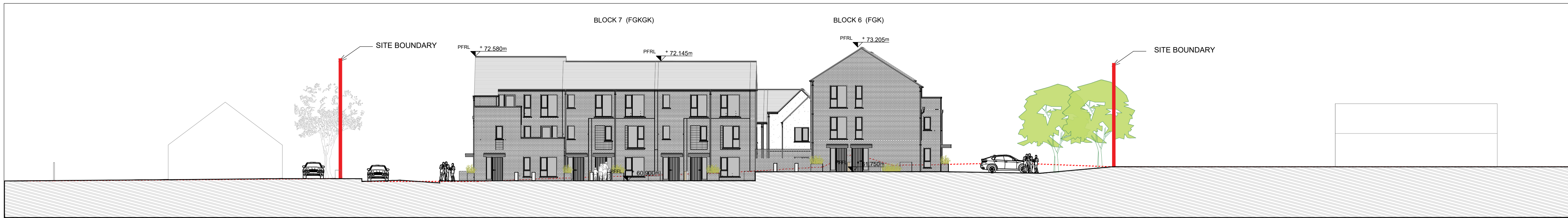
SECTION H-H 1:200 SCALE