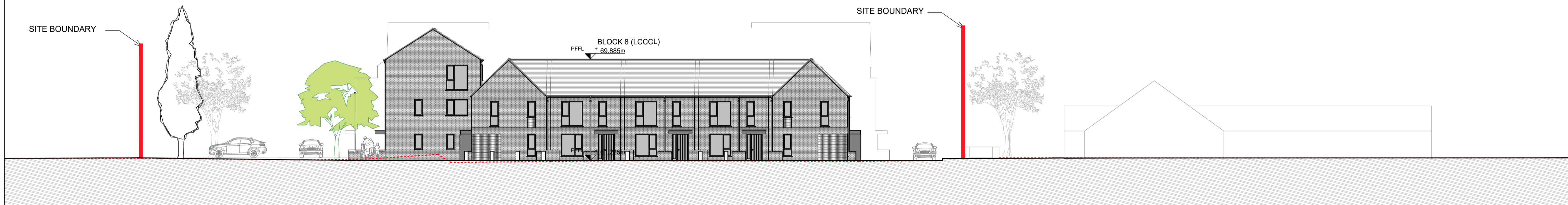
SECTION I-I 1:200 SCALE