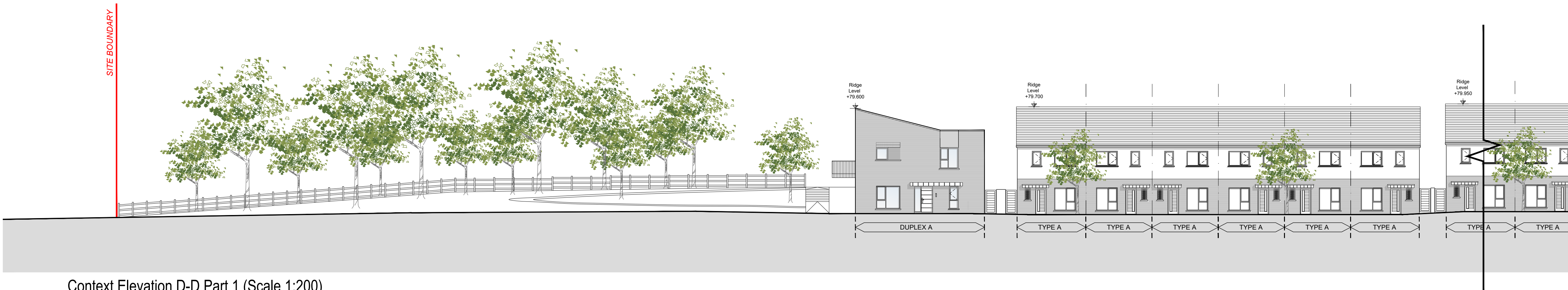
Context Elevation D-D Part 1 (Scale 1:200)