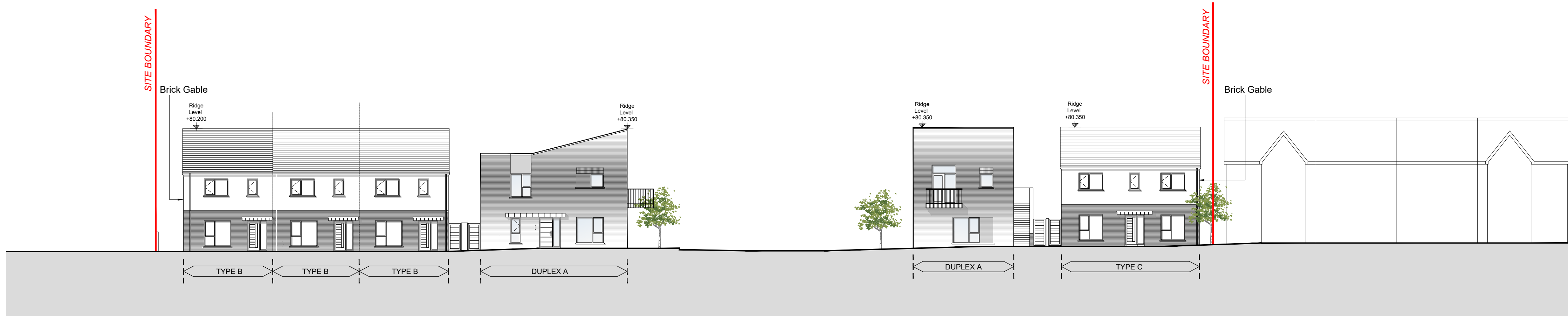
Context Elevation A-A (Scale 1:200)