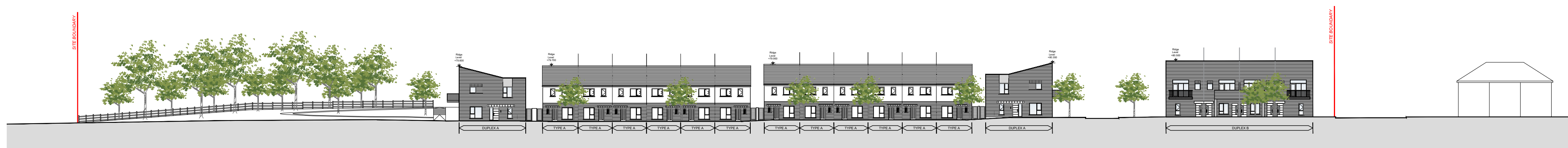
Context Elevation D-D Overall (Scale 1:500)