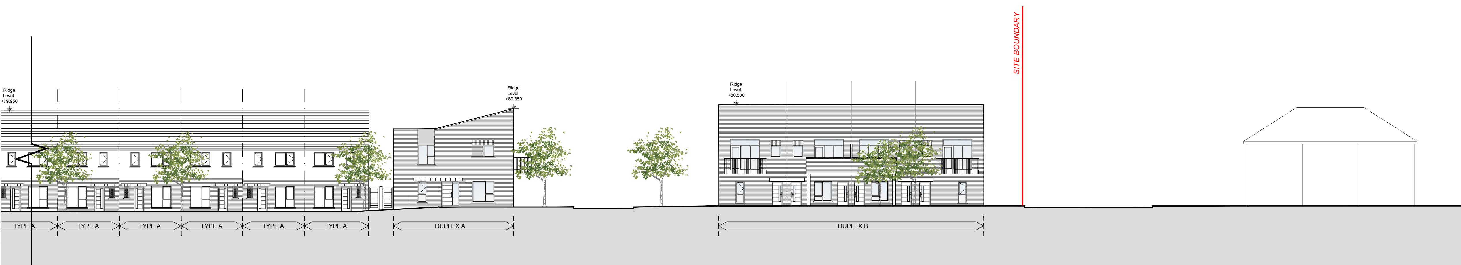
Context Elevation D-D Part 2 (Scale 1:200)