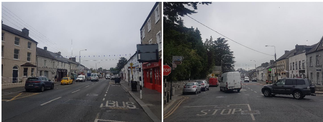
Figure 04 & 05: Image of Proposed Site – Main Street, Celbridge