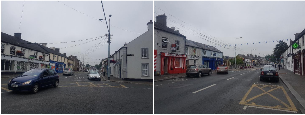
Figure 02 & 03: Image of Proposed Site – Main Street, Celbridge