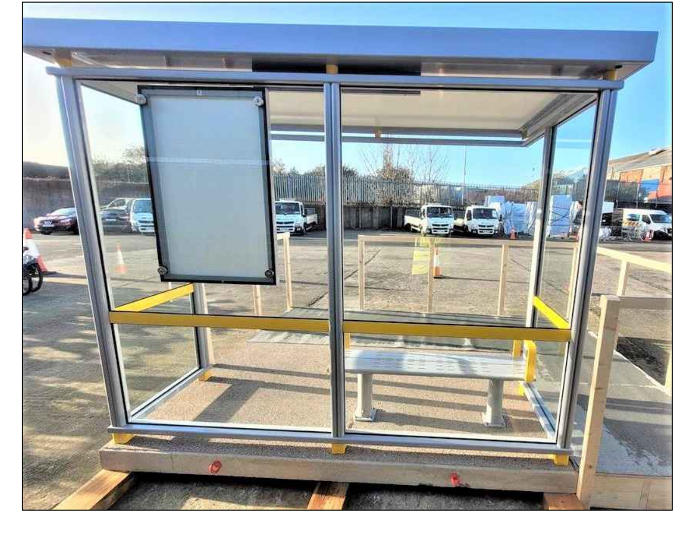
Bus shelter example "Pre-Assembled Shelter"