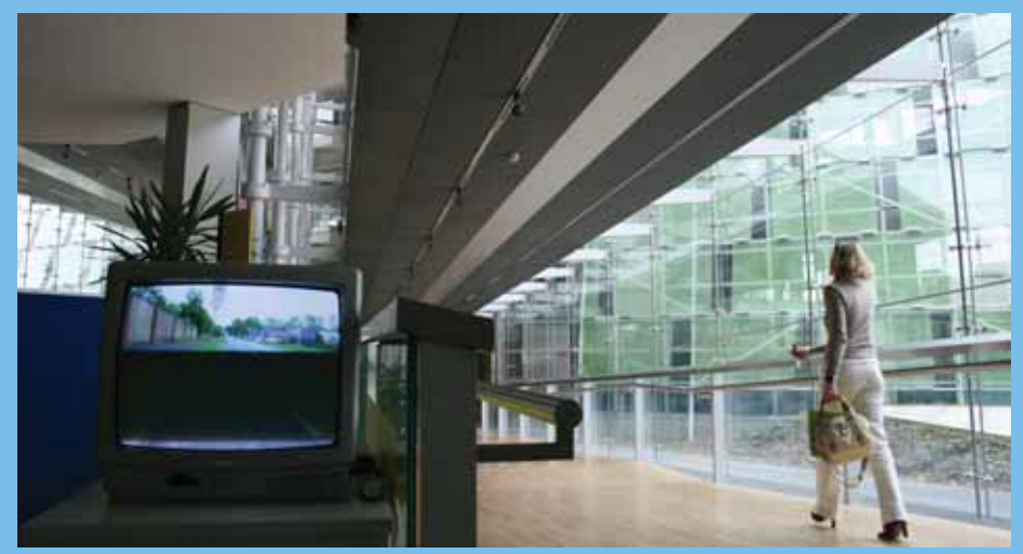
'Intersection 2', Transitopia, Public Art Project, by Dominic Thorpe