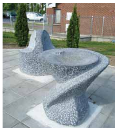
'Italian Garden', Gaelic View - Kill, Per Cent for Art Scheme by Benedict Byrne

As is best practice, Kildare County Council is committed to the documentation of all Public Art commissions but particularly for temporary works, for preservation, record, information and archival purposes. Documentation by means of photography, recordings, accessible information. publications and web page presentations will be used for exhibitions, communications, artwork launches and public relations to improve awareness and connectivity with the public. A dedicated web page for Public Art has been established at: www.kildare.ie/artsservice.