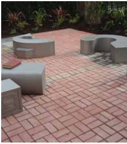
'Of Books, Questions and Other Things', Leixlip Library Play Area, by Declan Breen