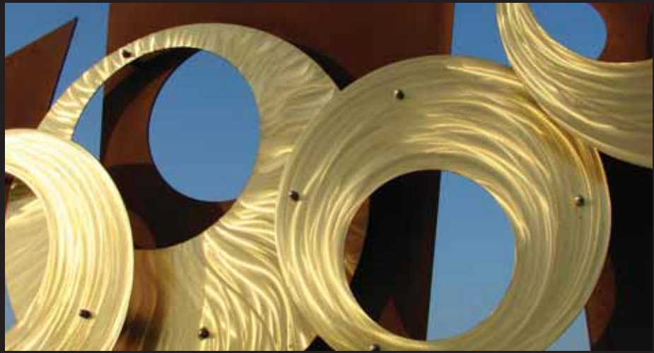
'From Here to There, From There to Here' - Kill Junction, Naas, Per Cent for Art Scheme, by Ned Jackson Smyth

A well constructed Public Art Policy can result in benefits such as the: