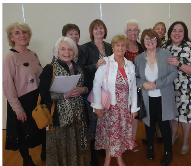
At a recent Creative Ireland Project Kildare reps from Newbridge

The new strategy will seek to build on these achievements. The opportunities and challenges are well understood. Kildare is a county with a sizeable older population (over 22,000) living in both large urban centres and sparsely populated rural areas.