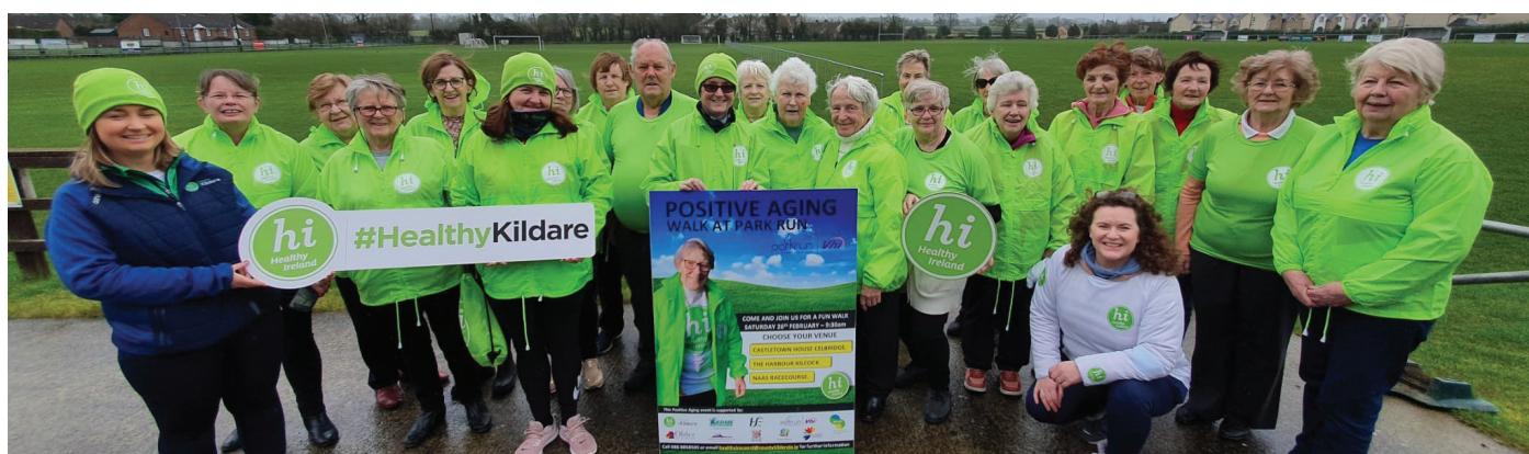
A recent Interagency initiative for positive ageing led by Healthy Kildare

Since its launch in 2006 the WHO Age Friendly Cities and Communities programme has evolved into a dynamic global network of national and local Age Friendly programmes with Ireland being very much an active member and indeed a leader in this global network.