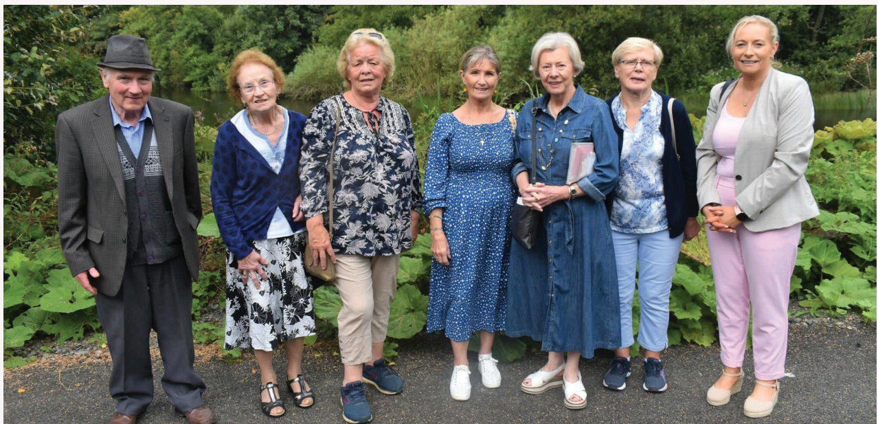
Ballymore Eustace age friendly / climate friendly village